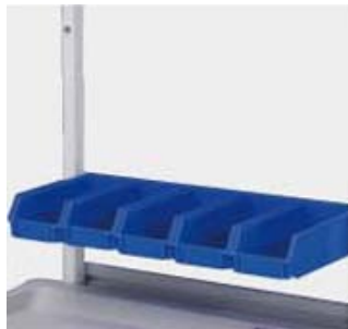
VBS-1 & VPR-1 Bulk storage bins (L) & back rail 75 x 105 x 190mm