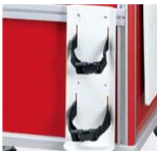
VO2 & VPR-2 Oxygen tank holder & side rail 145 x 125 x 403mm