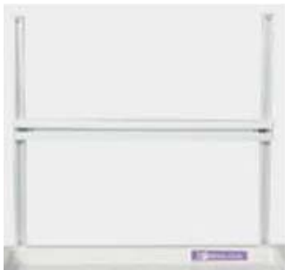
P-AB Accessory bridge 800mm