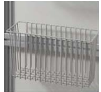
VMS & VPR-2 Multi-storage (L) & side rail