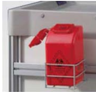
VSC & VPR-2 Sharps container & side rail