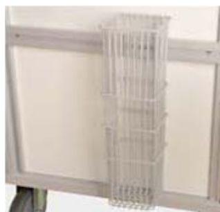
VCH & VPR-2 Catheter holder & side rail 100 x 100 x 480mm