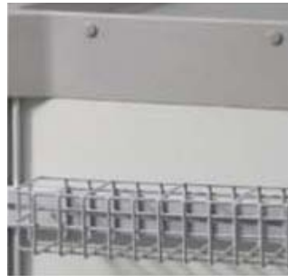
VBH & VPR-2 Bottle holder & side rail