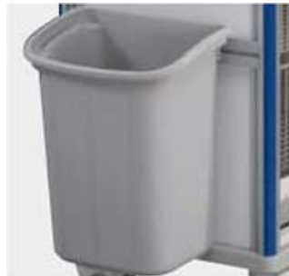
VWB & VPR-2 Waste bin & side rail 265 x 255 x 460mm