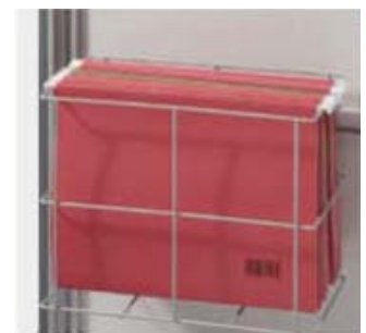
VDH & VPR-2 Documents holder & side rail 330 x 160 x 255mm