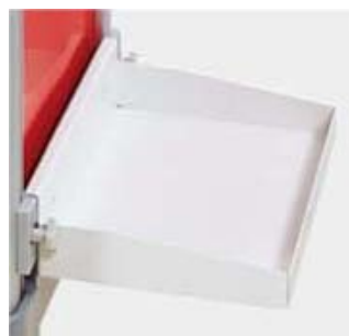
VSH & VPR-2 Suction machine holder & side rail 213 x 395 x 115mm