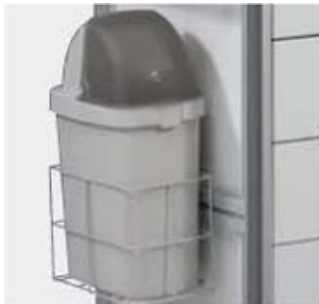
VWC & VPR-2 Waste container w/ lid & side rail 255 x 170 x 315mm