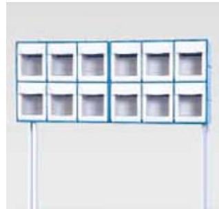
VTB-2 Tilt bin organiser (S) 600 x 111 x 230mm