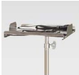
VDS Defibrillator shelf 355 x 355 x 415mm