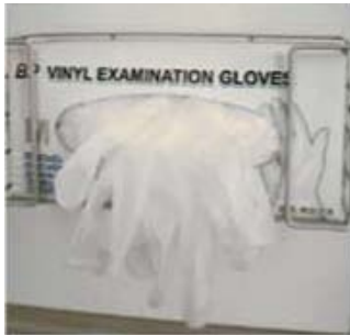
VGD & VPR-2 Glove dispenser & side rail