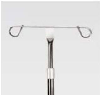
VIV IV pole