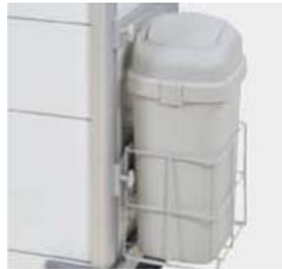
VGB & VPR-2 Garbage bin & side rail 255 x 170 x 315mm