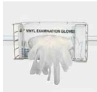
VGD & VPR-1 Glove dispenser & back rail 160 x 135 x 95mm