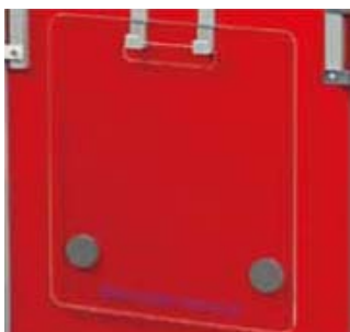
VCPR & VHK