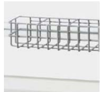
VBH & VPR-1 Bottle holder & back rail 355 x 95 x 80mm