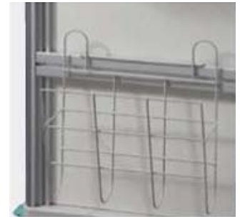
VFH & VPR-2 File holder & side rail 571 x 397 x 150mm