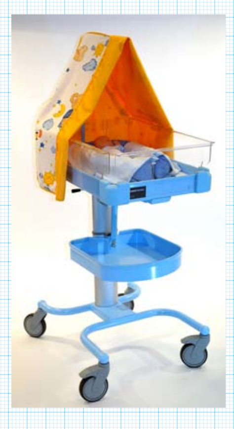
BB-3 KANMED BABYBED FIXED HEIGHT Complete unit Includes: Mattered Tent with Tent Pele Shelf

Complete unit Includes: Electrical height adjustment, Mattress, Tent with Tent Pole, Shelf, Power Cable,19 cm high Foldable Side Walls (24 cm height is also available).