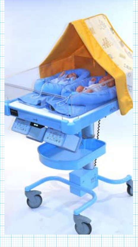
BB-4 KANMED<sup>°</sup>BABYBED TWINS

Mattress, Tent with Tent Pole, Shelf, 19 cm high Foldable Side Walls (24 cm height is also available).