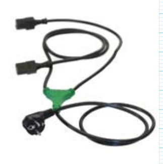
BB-XX POWER CABLE

Universal bracket for mounting for instance a vertical pole or other items.