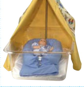
BB-57 TENT KIT FOR COTS

Stainless steel bracket for holding hand disinfection bottles. Max dia 70-80.