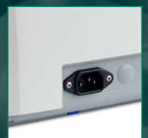
IEC power outlet. It is possible to order unit with IEC power