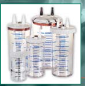
0,5 - 4 l polycarbonate suction jars autoclavable