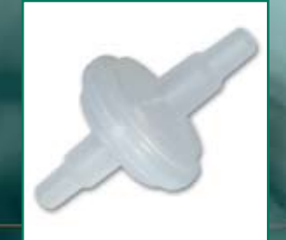
MSF microbiological suction filter (20pcs/box)