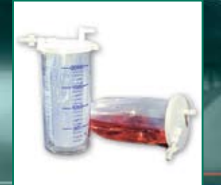
Disposable secreta bag MONOKIT